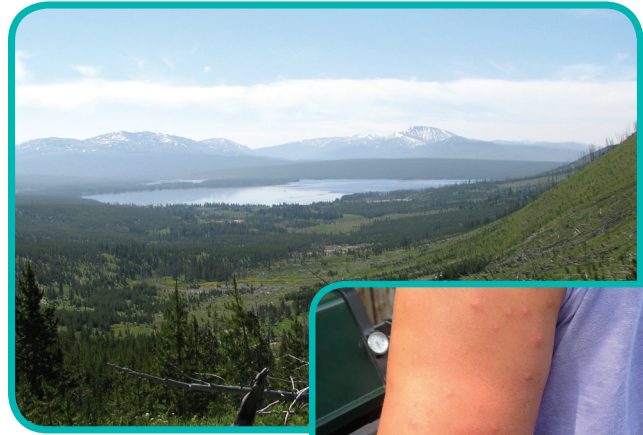
BEARS, BURNS AND BUG BITES: This is the arm of an EYE team member after only one day in the field. She was itching miserably for days!

If you were going on the expedition, which of the factors in the list above would worry you the most? Why?